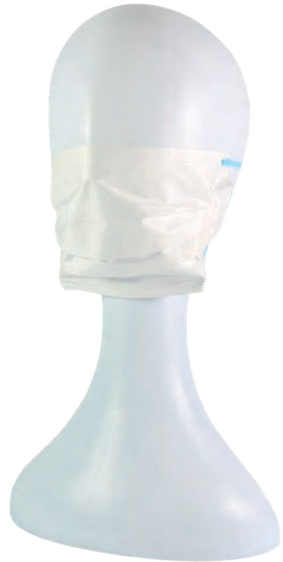
FACEGUARD 3 FACEMASK WITH HEADLOOPS