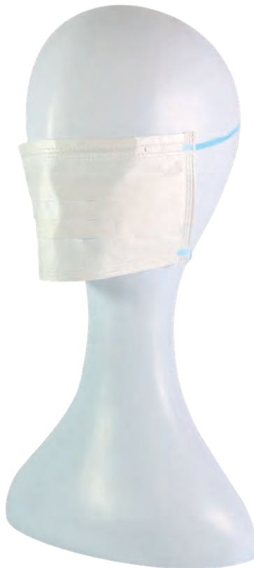
FACEGUARD 2 FACEMASK WITH EARLOOPS