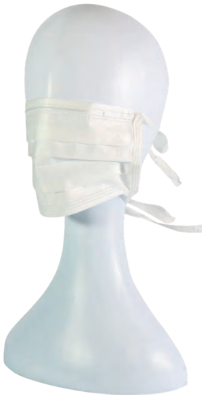
FACEGUARD 1 FACEMASK WITH TIES